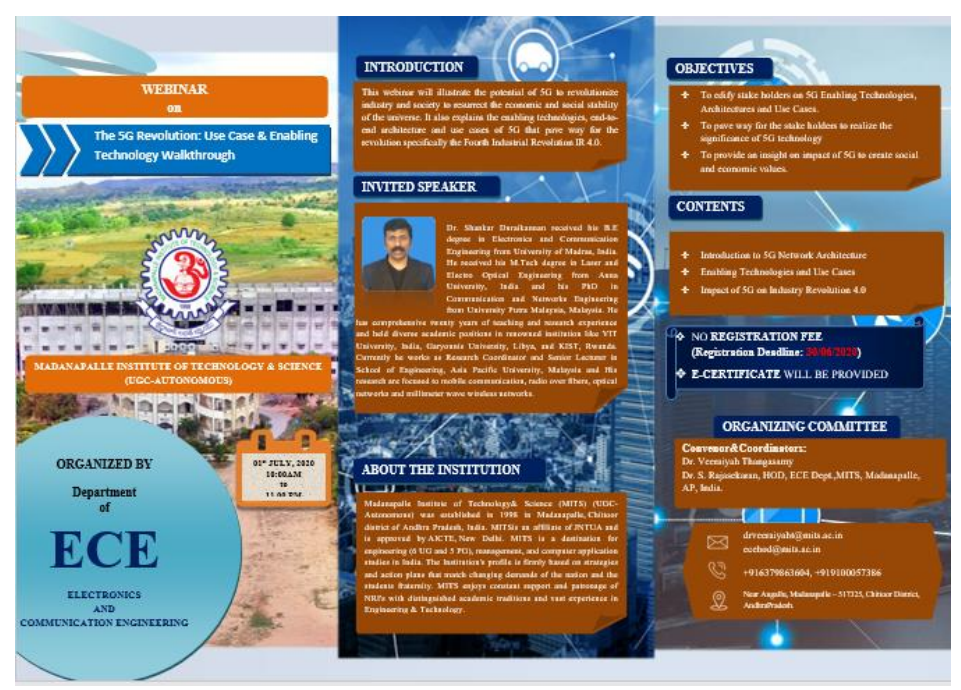
Figure 1: Poster for the webinar